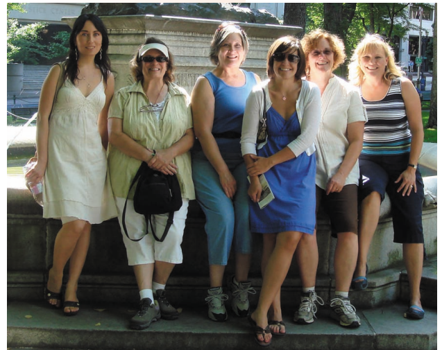
ACTS Oregon Staff

“As always our primary goal at the Oregon Transportation Safety Conference is to recognize members and the power communities have to impact traffic safety.”