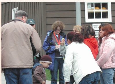
Migrant Headstart Seat Distribution