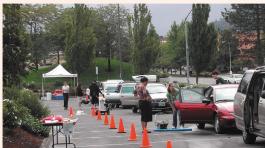
Clackamas Safety Fair

CSSRC staff also supported CPS technicians throughout Oregon at their check-up events. Currently there are over 200 agencies and 475 CPS Technicians conducting check up events and distributing seats on a regular basis throughout Oregon.